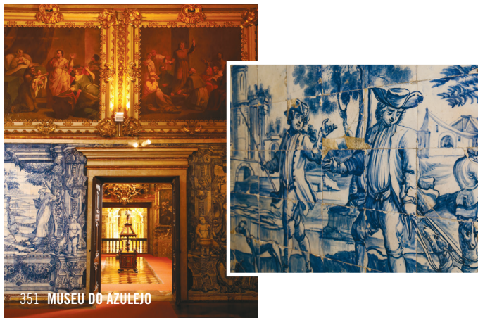
351 MUSEU DO AZULEJO

This iconic building in Chiado (one of the top photo spots in Lisbon) was built in 1864 and has a façade completely covered with decorative tiles produced at the Viúva Lamego factory. They show six allegorical figures representing Earth, Land, Water, Trade, Industry, Science and Agriculture.