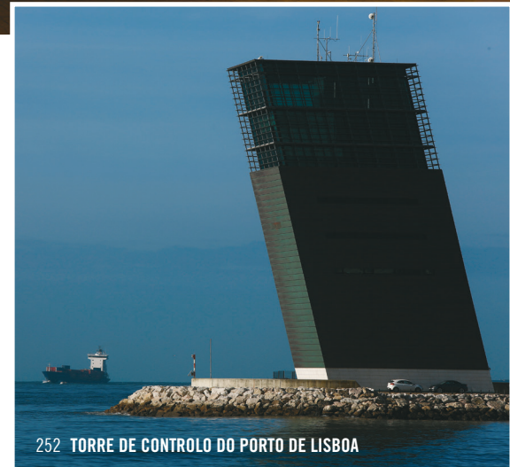
252 TORRE DE CONTROLO DO PORTO DE LISBOA